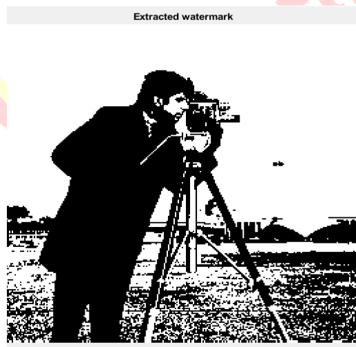
Figure (2) results image gray-level images