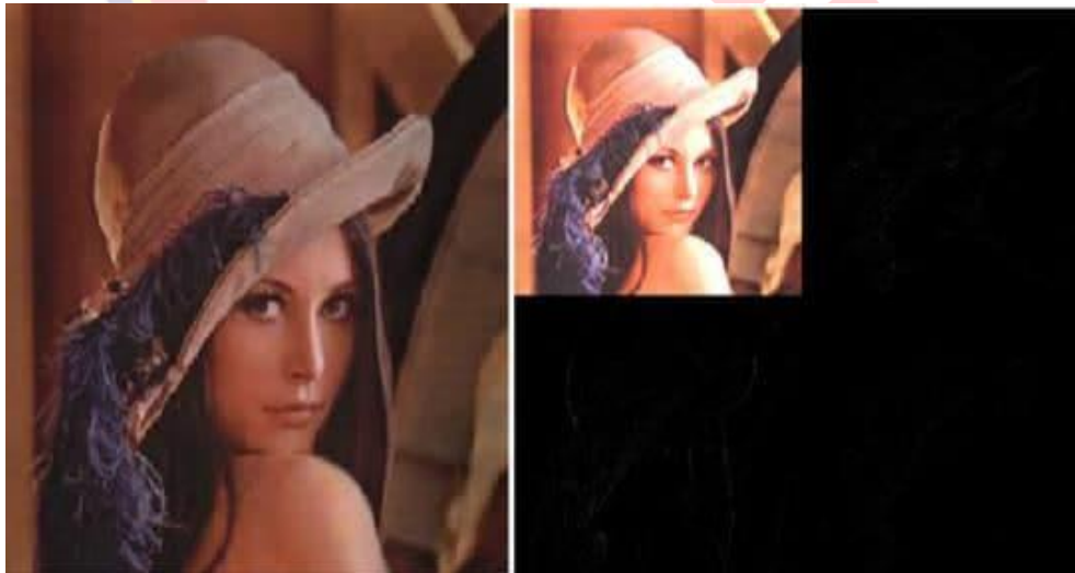
Figure (1) Haar Wavelet Transform

frequency coefficients are generated by taking half of the difference for the same two pixels. For two pictures of damnation, In addition to horizontal high-low (HL), vertical low-high (LH) and diagonal high-high (HH), WT decomposes the image into various sub-bands as the resolution approximation band or low-low (LL), detailed components as shown in Figure 1 In the low-frequency wavelet coefficients (approximation band), the essential information of the spatial domain image (smooth parts) exists and the edge and texture details usually exist in the high-frequency sub-bands, such as LH, HL, and HH[11]. The transformation of the Haar wavelet is similar to its opposite, which is considered to be a significant feature of it [7].